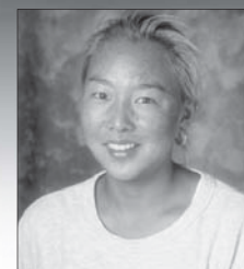
Jane Chi played singles in all four Grand Slams, achieving a career-high singles ranking on No. 62.