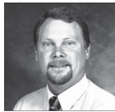
Paul Brown Event Management