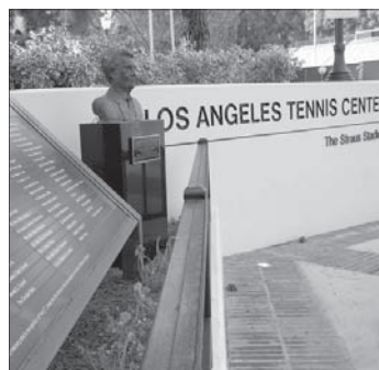
The front entrance to the Los Angeles Tennis Center.