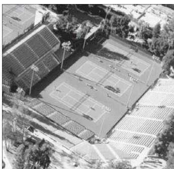
An aerial view of the Los Angeles Tennis Center's front three courts.