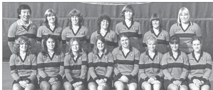
The 1982 Bruins won the WCAA Conference title, advancing to their second straight national final.

Note: Women's tennis was elevated to varsity status in 1976