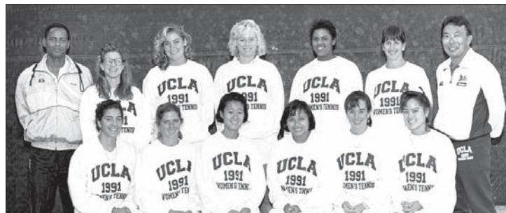
The 1991 UCLA team finished with a 23-5 overall record.